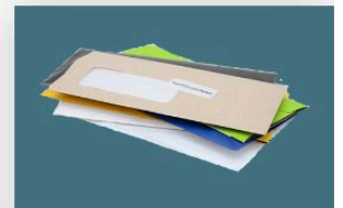
Paper, Magazines & Mail