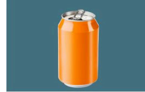
Aluminum & Tin Cans