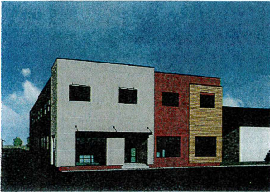
NW VIEW 215 S WILSON - JEFFERSON 04/27/20